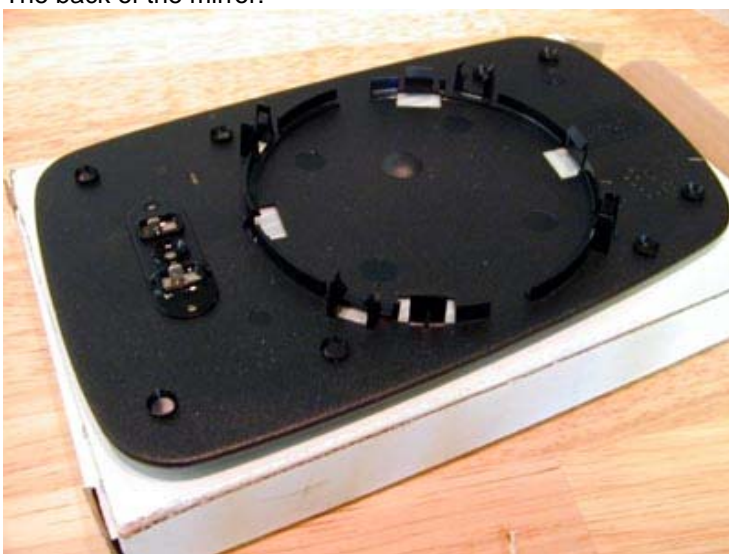
Here's how the stock mirror looks: